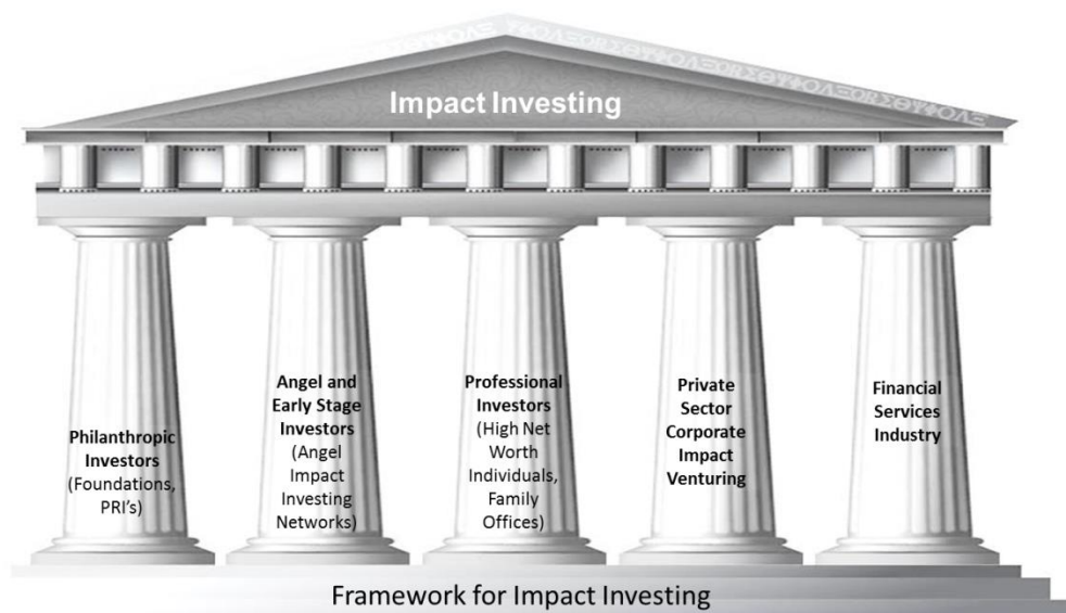
Figure 3: The Impact Investor Ecosystem

If impact investing is to respond to megatrends, thrive in an enabling policy environment, and take advantage of the expertise and value chains of large corporations to scale social impact, it needs a lot of capital at all investment stages, and from a variety of sources. As mentioned above, the industry is currently growing from a low capital base of USD 36 billion and is nevertheless expected to reach USD 400-1000 billion by the end of the decade. This section describes the division of labor among key players in the investor ecosystem (see Figure 3 ).